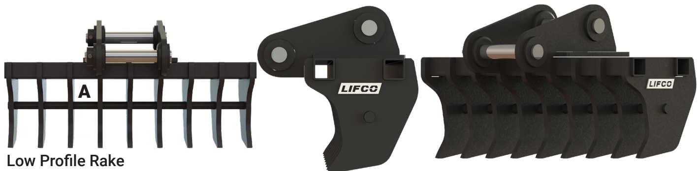
Low Profile Rake

C. The Deep Penetration Rake has replaceable teeth, making it easier to do a quick repair without leaving your work site, should a tooth break. The Low Profile would be used after all the large objects have been removed by the Deep Penetration Rake, and usually do not require replaceable teeth.