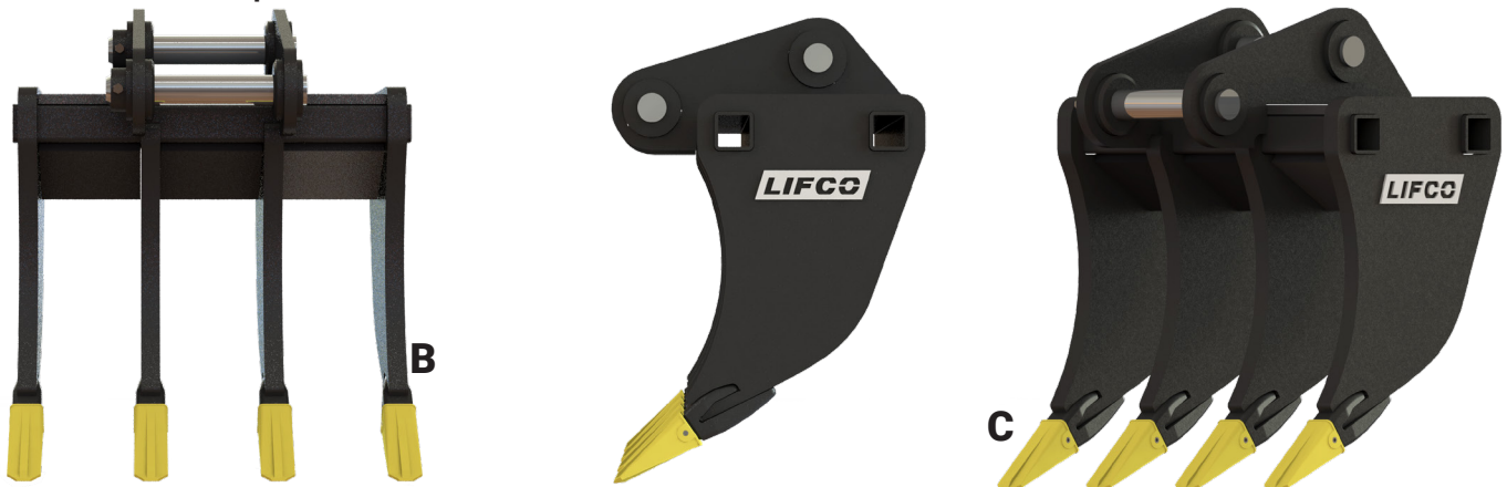
Deep Penetration Rake