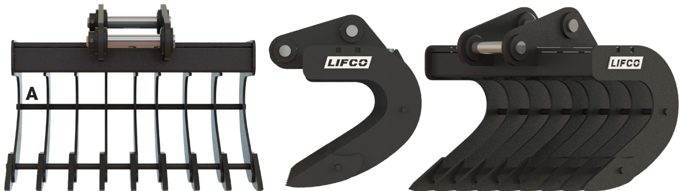
Low Profile Scoop Rake